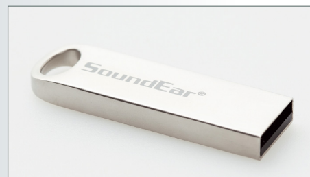
USB nøgle til aflæsning af data