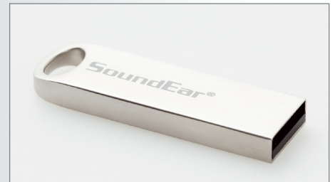
USB key for export of data.