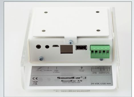
SoundEar®3 – back